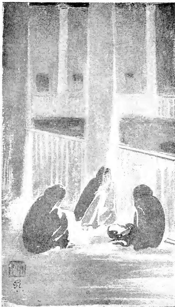
THE SERVANT MAIDS IN THE VERANDAH